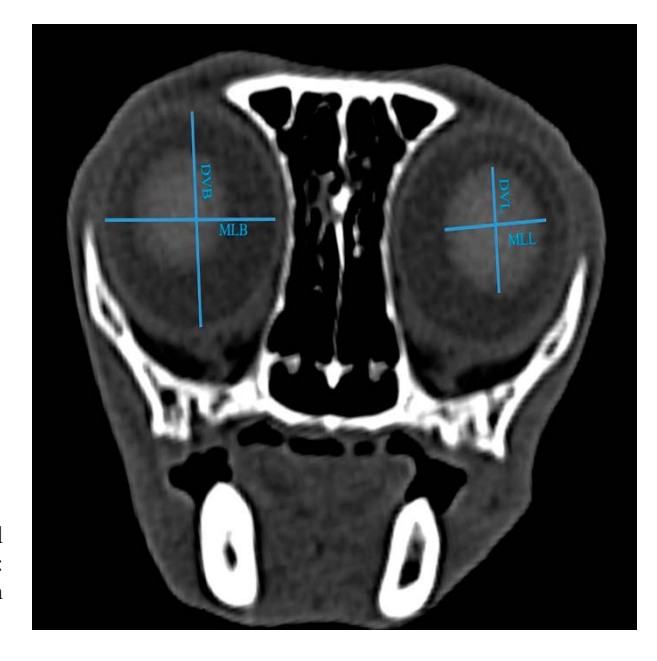
Figure 1 . Measurement points of the bulbus oculi in Van cats (axial CT image). DVB: Dorsoventral length of the bulbus oculi; MLB: Mediolateral length of the bulbus oculi; DVL: Dorsoventral length of the lens; MLL: Mediolateral length of the lens.