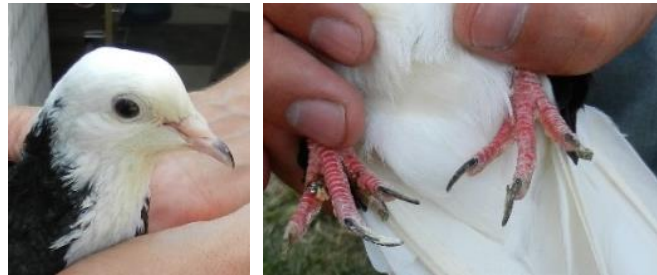
Figure 1. The black pigmentasyon on the beak and claw (Zikir).