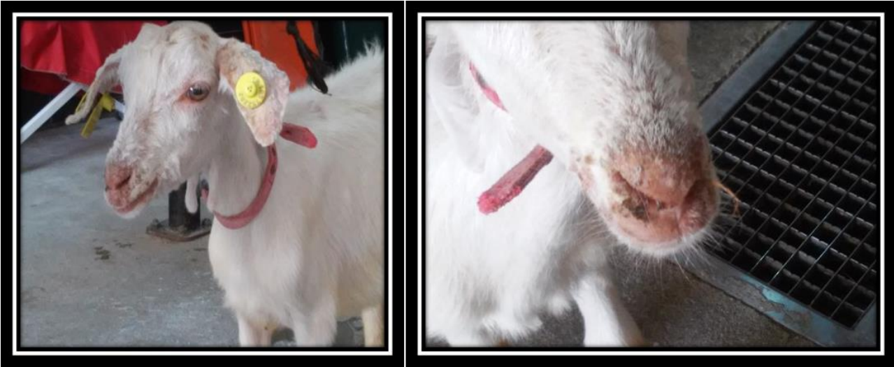
Figure 2. Lesions around the mouth and nose in goat kids with dermatophilosis.

There is no specific treatment for D. congolensis infection (2). It is stated that clinical symptoms may improve spontaneously in animals with a small number of agent input and developed immune system (7). However, the infection may cause significant economic losses since it is associated with high morbidity and mortality. Briefly, the agent leads to significant economic losses by causing decreases in milk and meat yield in various animal species. In this study, it was observed that there was no significant loss of weight in goat kids. This can be explained by the early diagnosis and treatment of the infection due to the high sensitivity of the local people on animal health.