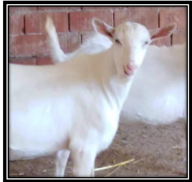
Figure 3. The goat kid after treatment.

to test the efficacy and success of these drugs in the study. In this study, it was determined that the lesions regressed from day 5 and disappeared completely (Figure 3) over time along with the parenteral tylosin administration for 3 days with parenteral single dose long-acting oxytetracycline in goat kids. After the study, the herd was followed for 4 months and it was observed that no recurrence or a new case was detected.