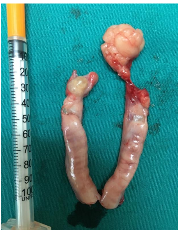
Figure 1. Left (L) unilateral ovarian agenesis in cat. Şekil 1. Kedide sol (L)- tek taraflı ovaryum agenezi.

Gokulakrishnan and George (3) stated that ovarian agenesis could be directly related to genital malformations such as the absence of the ipsilateral uterine tube or uterine horn, however, no such abnormality was seen in the present the case. It was reported that ectopic ovary or a fibrotic part of ovarian remnants may be detected macroscopically at the site of ovary during surgery in some cases (1,5). It is necessary to perform a comprehensive histological investigation examination to reveal whether an ovary is completely absent or not, and presence of concomitant tract abnormalities.