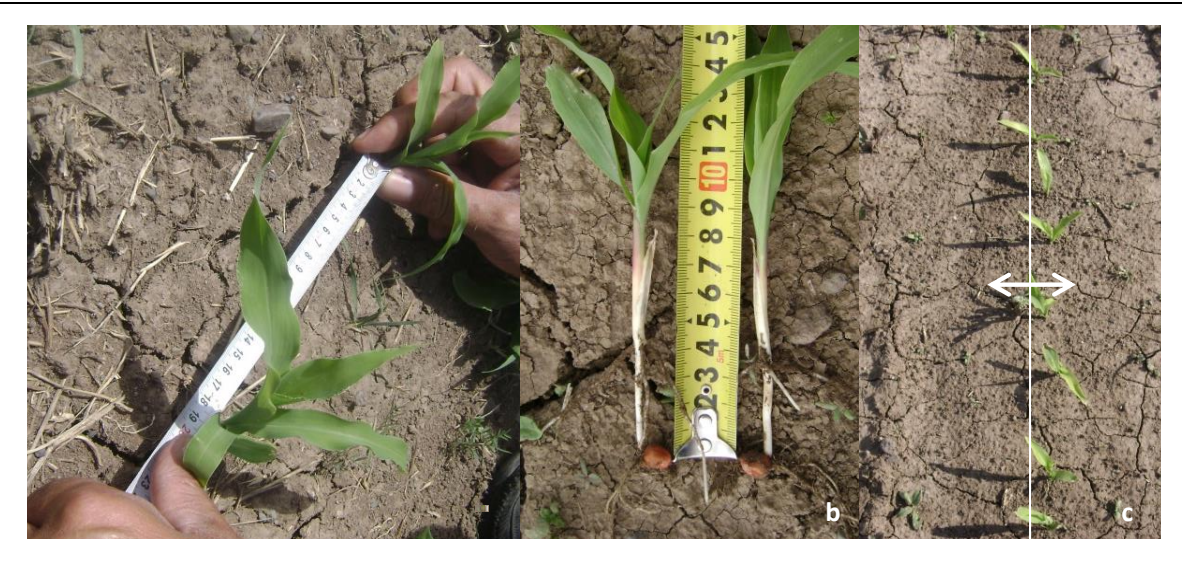
Figure 2- Measurements of intra-row spacing (a), sowing depth (b) and deviation from the row (c)

The measurement methods described by Kachman & Smith (1995) were used to evaluate the performance of the single-seed unit. These were multiple index, miss index, quality of feed index and coefficient of precision (MULT, MISS, QFI and PREC, respectively). The multiple index is the spacing percent between consecutive plants in a row, equal to or fewer than half of the target seed spacing (Z) ( MULT \le 0.5Z ). The miss index is the spacing percent that is greater than 1.5 times the target seed spacing (MISS > 1.5Z). The quality of feed index is the plant spacing percent that is greater than 0.5 times but not greater than 1.5 times the target seed spacing ( 0.5Z < QFI \le 1.5Z ). In the sowing process, the lower the miss and multiple indices are, the better is the sowing quality. The precision coefficient index is the variation coefficient of seed or plant spacing in a row (Kachman & Smith 1995; Singh et al. 2005). The limit values of these indices are shown in Table 2 (Önal 2011; Yazgi & Degirmencioglu, 2014).