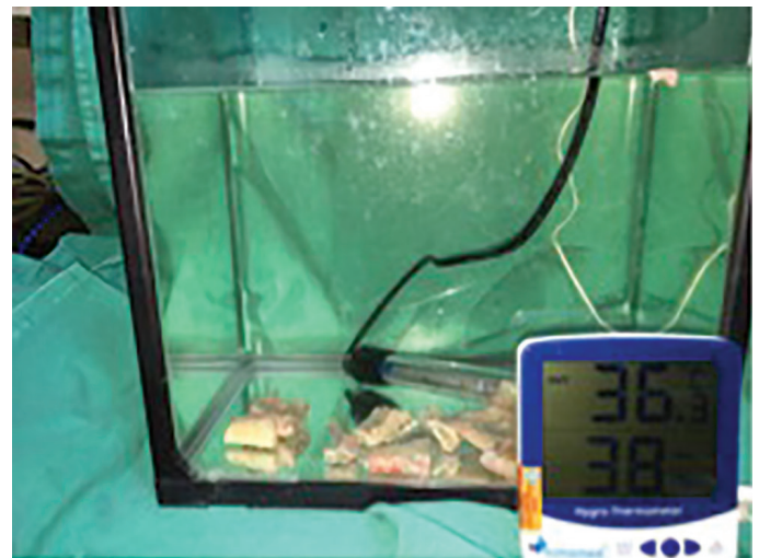
Figure 1. A thermal controller was used to adjust the temperature of the water close to the body temperature.

No statistically significant difference was observed between initial temperature measurements before the application of each laser. The temperature of specimens irradiated with diode laser was significantly increased compared to specimens irradiated with ErCr:Ysgg laser ( p<0.05 ) (Table 2). There was no statistically significant difference between the mean temperature values of bone and soft tissues before and after laser application (Table 3).