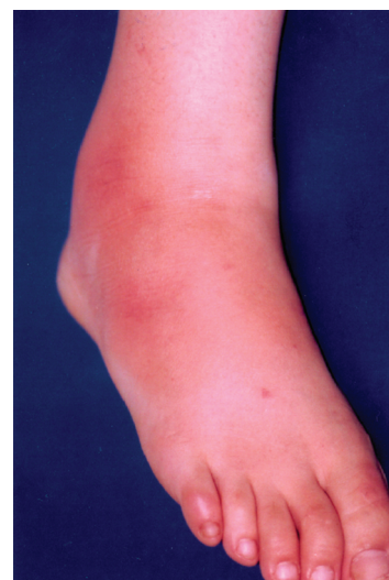
FIGURE 2. Erysipelas-like erythema in a patient with familial Mediterranean fever.