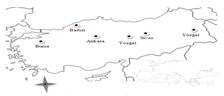
Figure. 1. Distribution of serum samples collected from various regions of Turkey. Şekil 1. Türkiye'nin farklı bölgelerinden toplanan serum örneklerinin dağılımı.

Isolation: Isolation of the agents from the rodent and water samples: In order to detect the rodents that were bacteremic with F. tularensis , liver and spleen samples from 40 rodents were inoculated into the Francis medium supplemented with antibiotics and defibrinated sheep blood. After inoculation processes, dishes were incubated at 37^{\circ} C for 10 days under 10% CO<sub>2</sub> environment. Colony morphology, physical features and development times of forming colonies were evaluated (5,8). In order to isolate the agent from water, samples