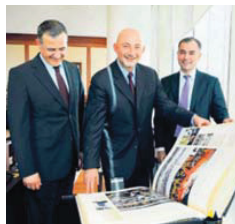
Bottom: The owner of NTV television Ferit Şahenk was listed number one in 2011 Forbes Wealthiest People in Turkey. Şahenk was on the front page of Zaman newspaper on 26 April 2009.

aside their disagreements to support political initiatives that pave the way for strategic investments in construction, contracting and energy. Therefore, it is necessary to investigate who operates these holding companies, how they are enriched via public tenders, what kind of networks they create, and the role of the AKP government in this context.